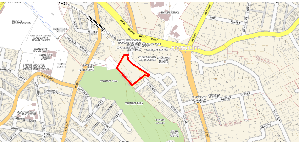
FIGURE 1 The site (edged in red)

This site specific chapter applies to the land identified on the map at Figure 1 (the site). The land comprises 8-10 New McLean Street, Edgecliff, being legally described as SP 20548.